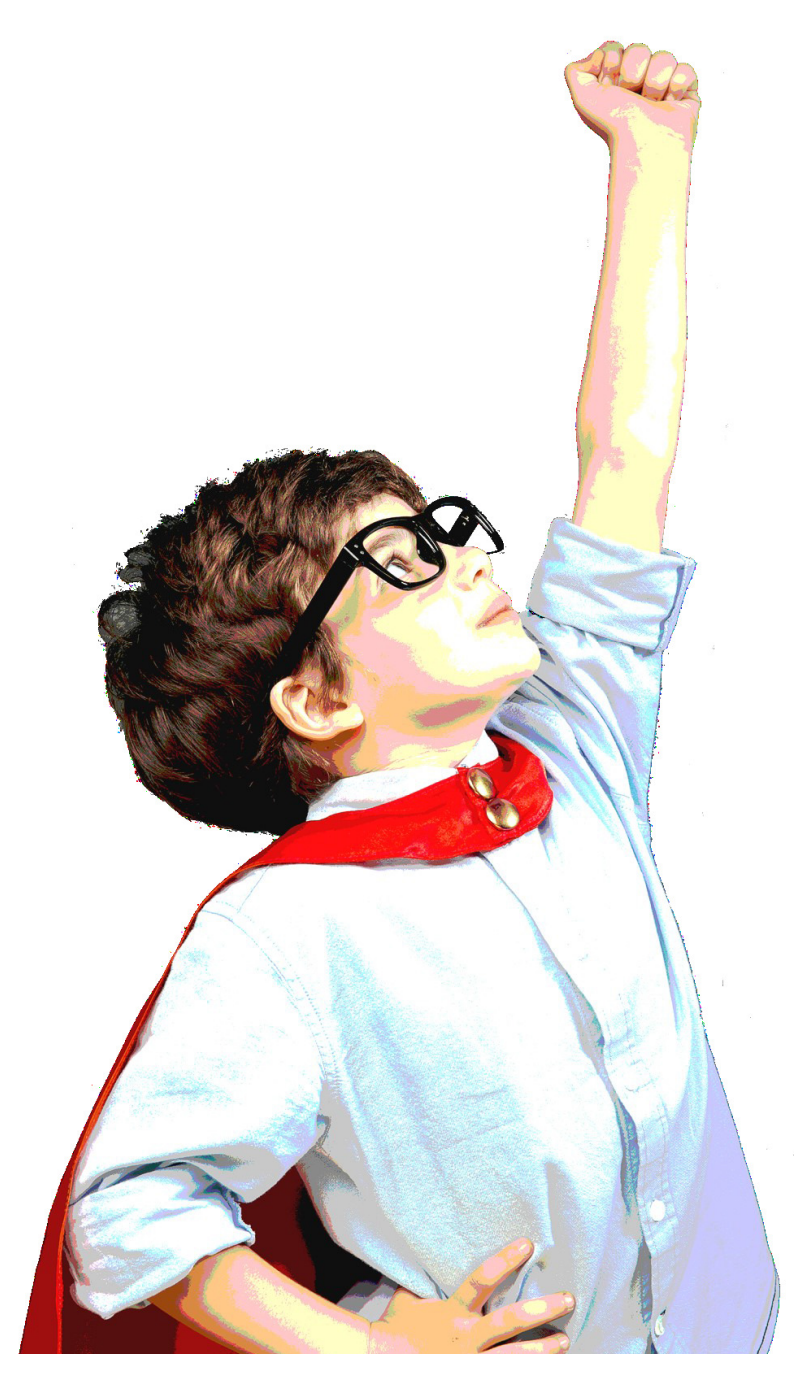
A play by Tom Long TEACHER'S GUIDE